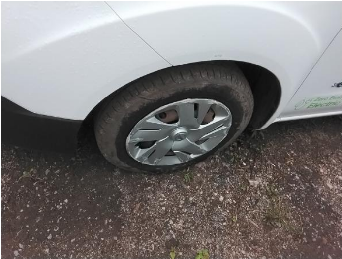
3: Wheel Trim nsf Broken Replace