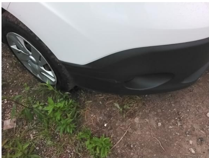
1: Bumper Front Scratched Over 100mm Thru Paint