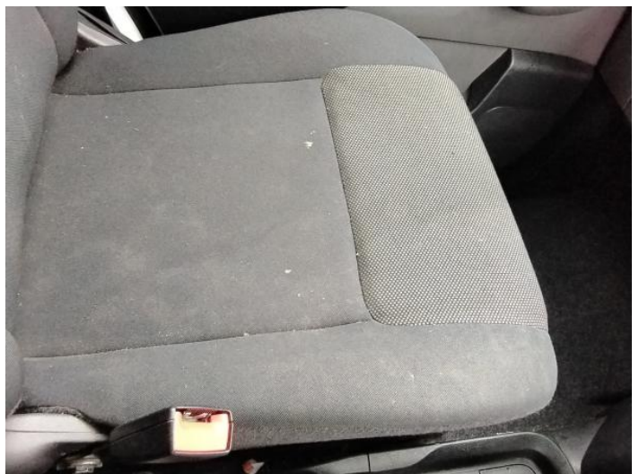
8: Seat Base Cover nsf Soiled Heavy