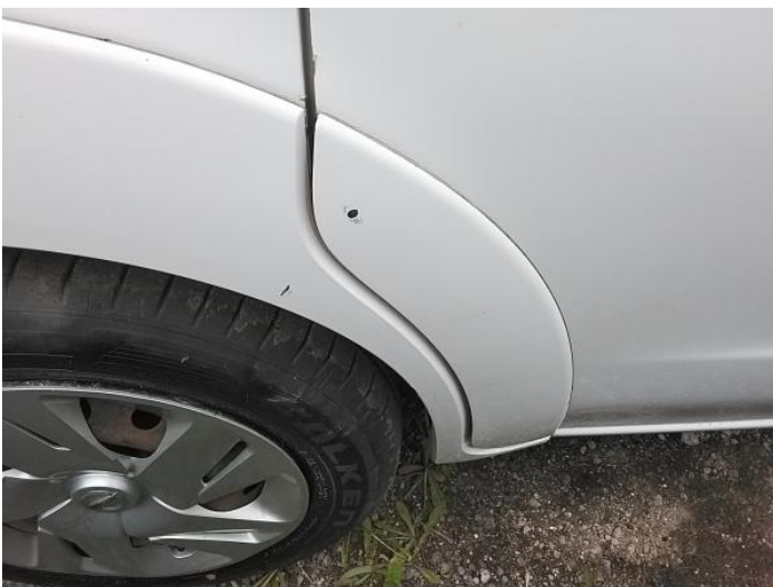
7: Qtr Panel osr Chipped Multiple Chips