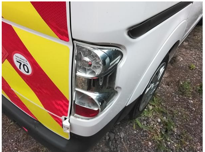
6: Lamp osr Broken Replace