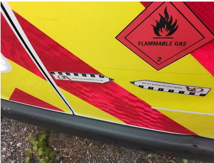
5: Door osr Dented Over 30mm