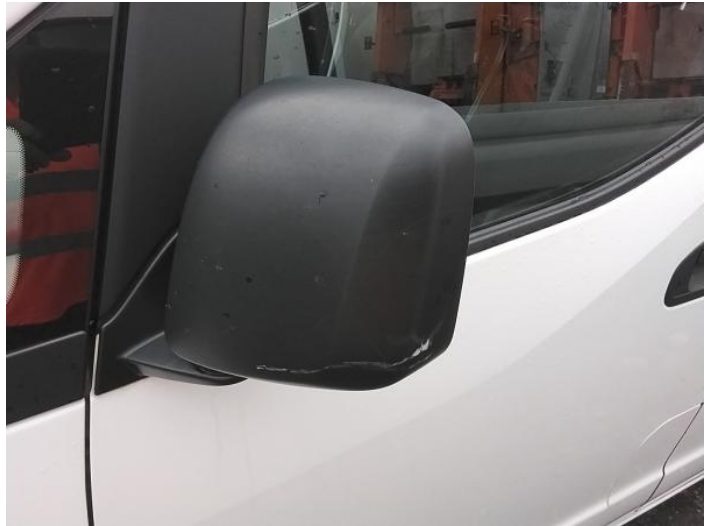
4: Door Mirror Assy nsf Scuffed (Unpainted) Over 100mm